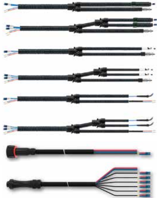
Mobile Hybrid Drops