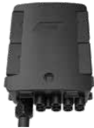
F-Series Hybrid Box