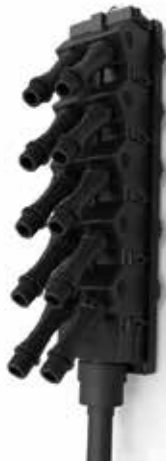
M-Series Hybrid Box